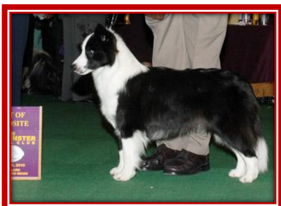
Best Opposite Sex Ch Sportingfields Little Surfer Girl