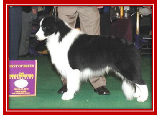
BOB – Ch Borderfame Signature