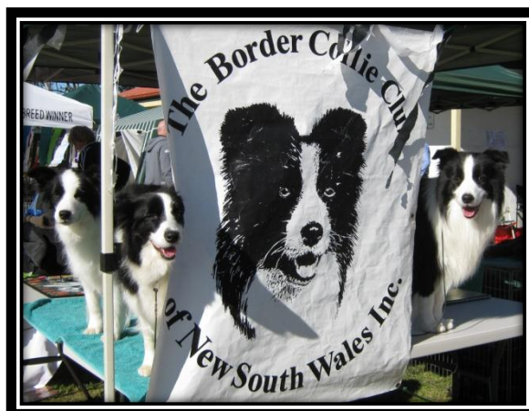
Above: Turner, Shiloh & Ukko await their adoring public. Below: The BCCNSW stand.

Congratulations to everyone for such a successful day and for presenting the Border Collie at its best. It was announced that this is hoped to become an annual event – the Dogs NSW answer to ‘Pet Expo’ so to speak – so perhaps we are also witnessing the beginning of a great event. The day was certainly an enjoyable one, and we are all looking forward to next year which is sure to be bigger and better again!