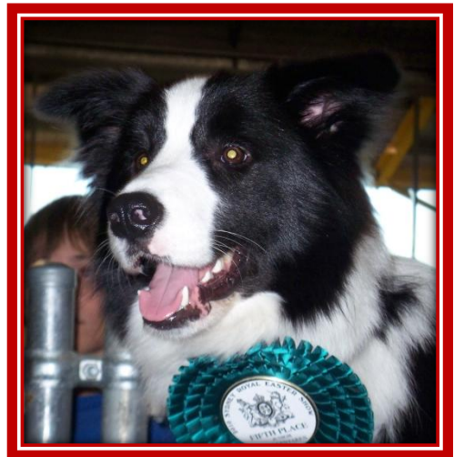
5 th in Puppy Sweepstakes winner.