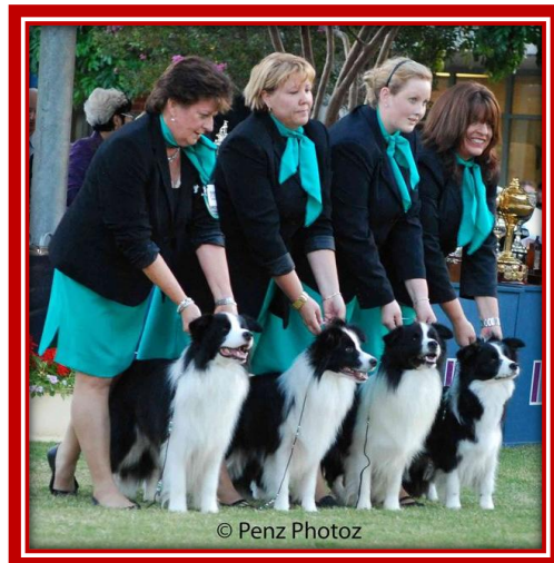
Border Collie Breeders Group.