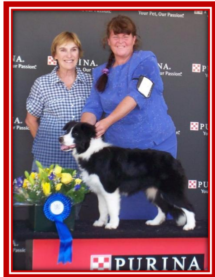
Baby Puppy Sweepstakes winner.