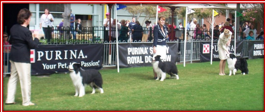
L-R: Best of Breed, Runner Up Best of Breed & Puppy Of Breed winners.