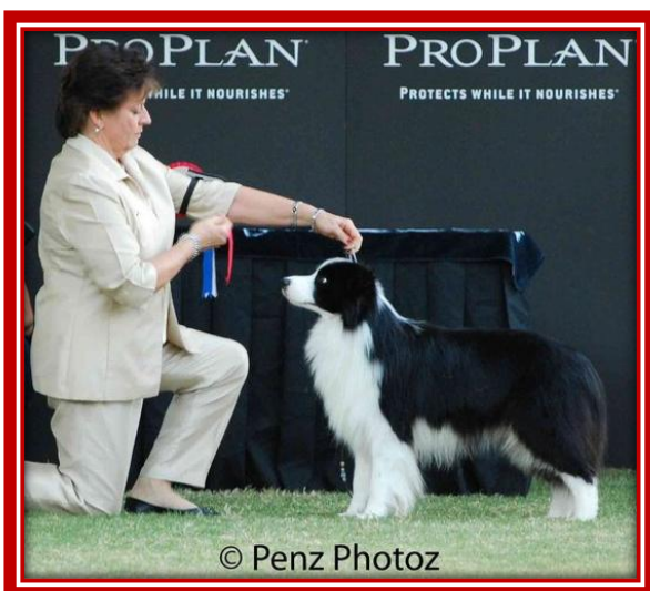
Best In Working Dog Group – the Border Collie!