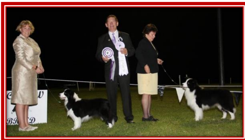
Best In Show (left) and Runner Up to Best In Show (right)