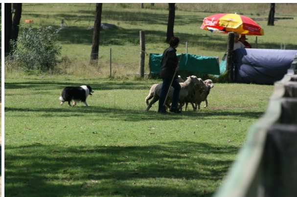
Rex - A course Started - Qualifying on sheep