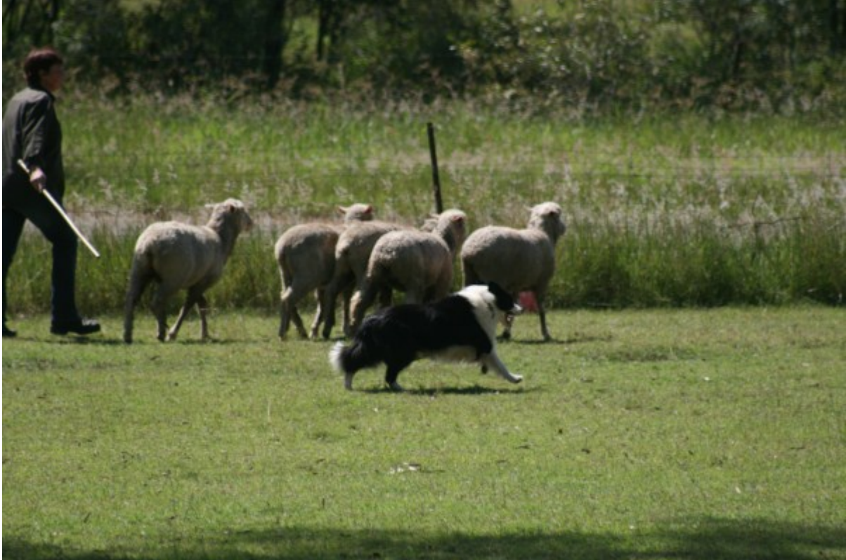
Rex at work in A Course Started - Qualifying on sheep