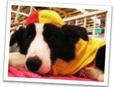
Above: one of our August entries...

Thank you to all those members who have submitted photographs for this month – we are proud to announce that August saw the competition entries well exceed the 100 MARK!! If you would like to become involved and show your 'artistic' side, it is not too late... The final month of competition closes on the 20 th September . It only costs $1 per photograph , and you can enter as many as you like! All money raised goes towards topping up the club's rescue fund.