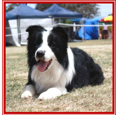
Above: Ch Bordalace Day Dream Believer PT