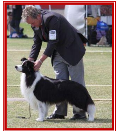
Above: Ch Innisman All Said N Done